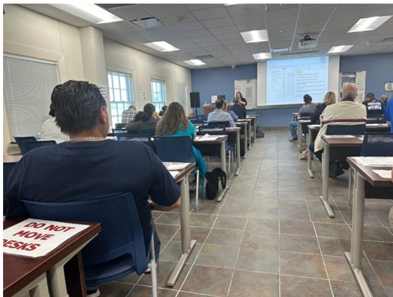
The Intellectual Property Workshop at the Good Samaritan Veterans Outreach & Transition Center

Hope Shimabuku—Director of the Texas Regional United States Patent and Trademark Office (Dallas)